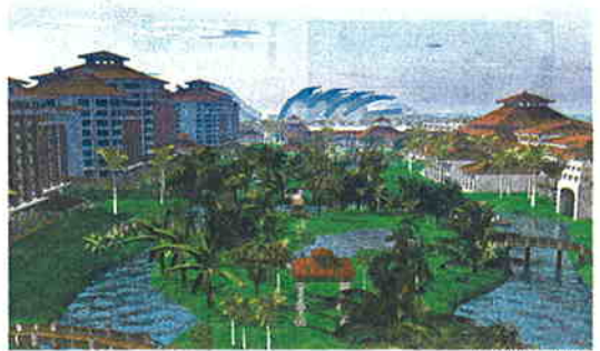
Rendering of a proposed casino-resort in Vietnam.

Despite hurdles on the home front, all four major U.S. operators have for years jockeyed to get into one of Asia's most promising gambling markets: Macau. When the former Portuguese colony reverted